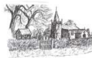
All Saints' Kingston Seymour