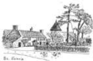
St John's Kenn