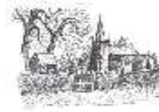
All Saints' Kingston Seymour