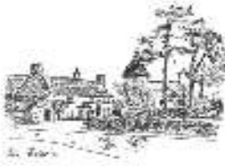
St John's Kenn