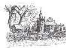
All Saints' Kingston Seymour