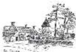
St John's Kenn