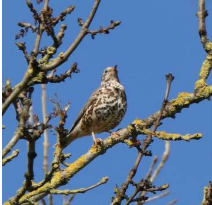
Mistle Thrush

In fact a Willow Warbler was singing from a roadside tree opposite the Horsecastle Chapel in Yatton but it soon departed.