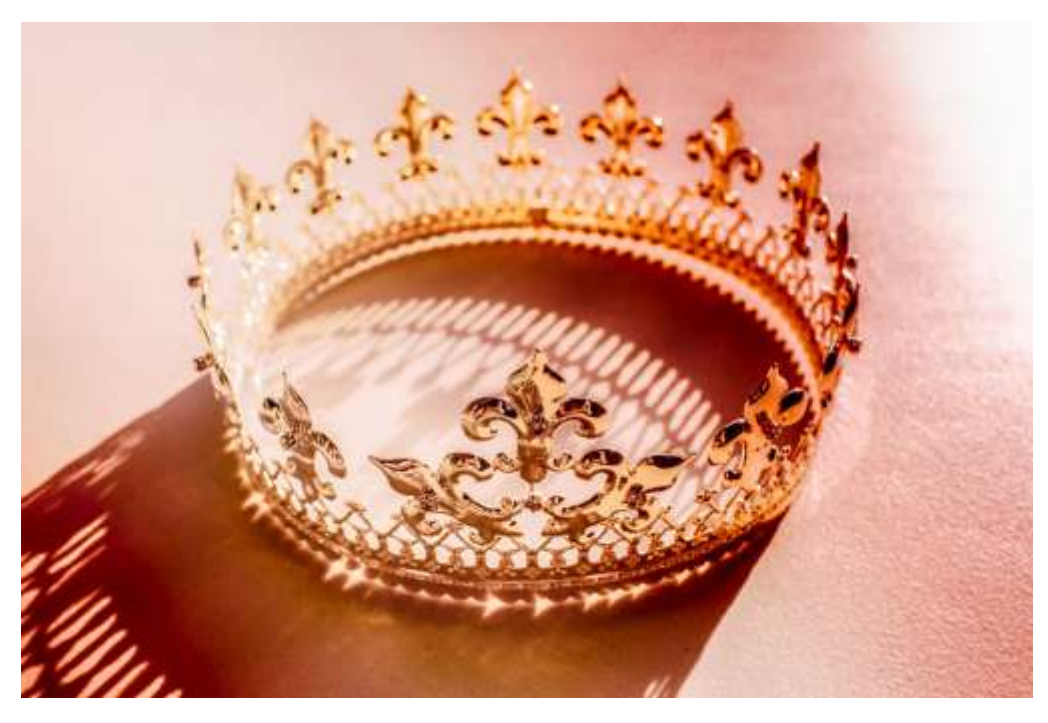
Queen's Platinum Jubilee.

On Sunday 5<sup>th</sup> June 2022 we will be celebrating the Queen's Platinum Jubilee.