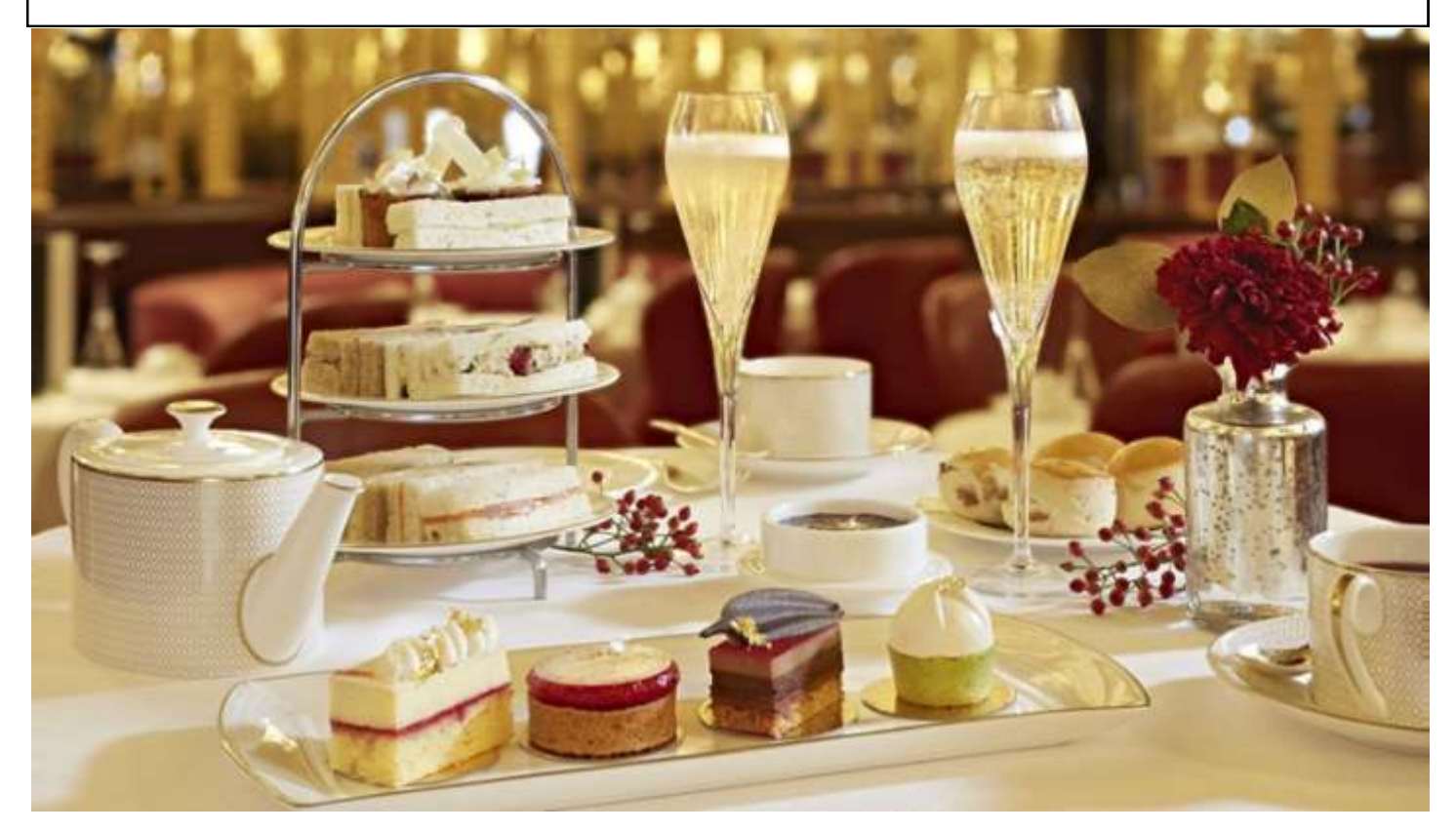
Celebrate Victory in Europe. V.E. Day. 8th May. 2-4pm Picnic in your own Garden Party.

There had been several ideas suggested for a village party this year. Commemorating the Centenary of the Village Hall, a special wedding anniversary or a revival of the Kenn and Kingston fete.