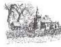
All Saints' Kingston Seymour