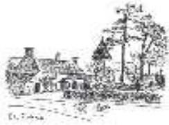
St John's Kenn