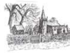
All Saints' Kingston Seymour