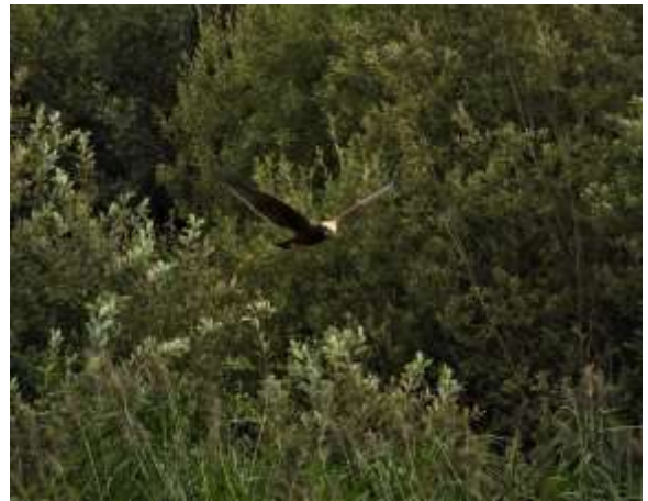
Mark Savage's picture shows a female Marsh Harrier on the Somerset Levels

A female Marsh Harrier paid a visit but I expect that she was hunting over a wide area. In 1971 Marsh Harriers were down to single pair, in East Anglia, but the creation of wetlands, many of them from mineral extraction, has seen an upturn in numbers. Marsh Harriers used to winter in Southern Europe but milder winters here now allow them to remain all year.