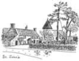
St John's Kenn