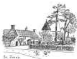
St John's Kenn