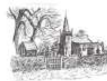
All Saints' Kingston Seymour