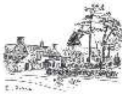
St John's Kenn