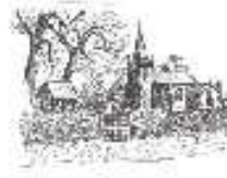
All Saints' Kingston Seymour