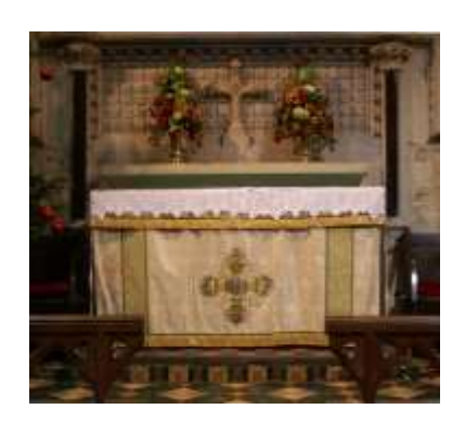
Altar Guild Flowers

Could people doing flower arrangements in the Church please do so on Saturday 16th December.