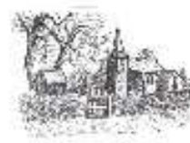
All Saints' Kingston Seymour