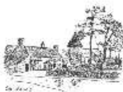
St John's Kenn