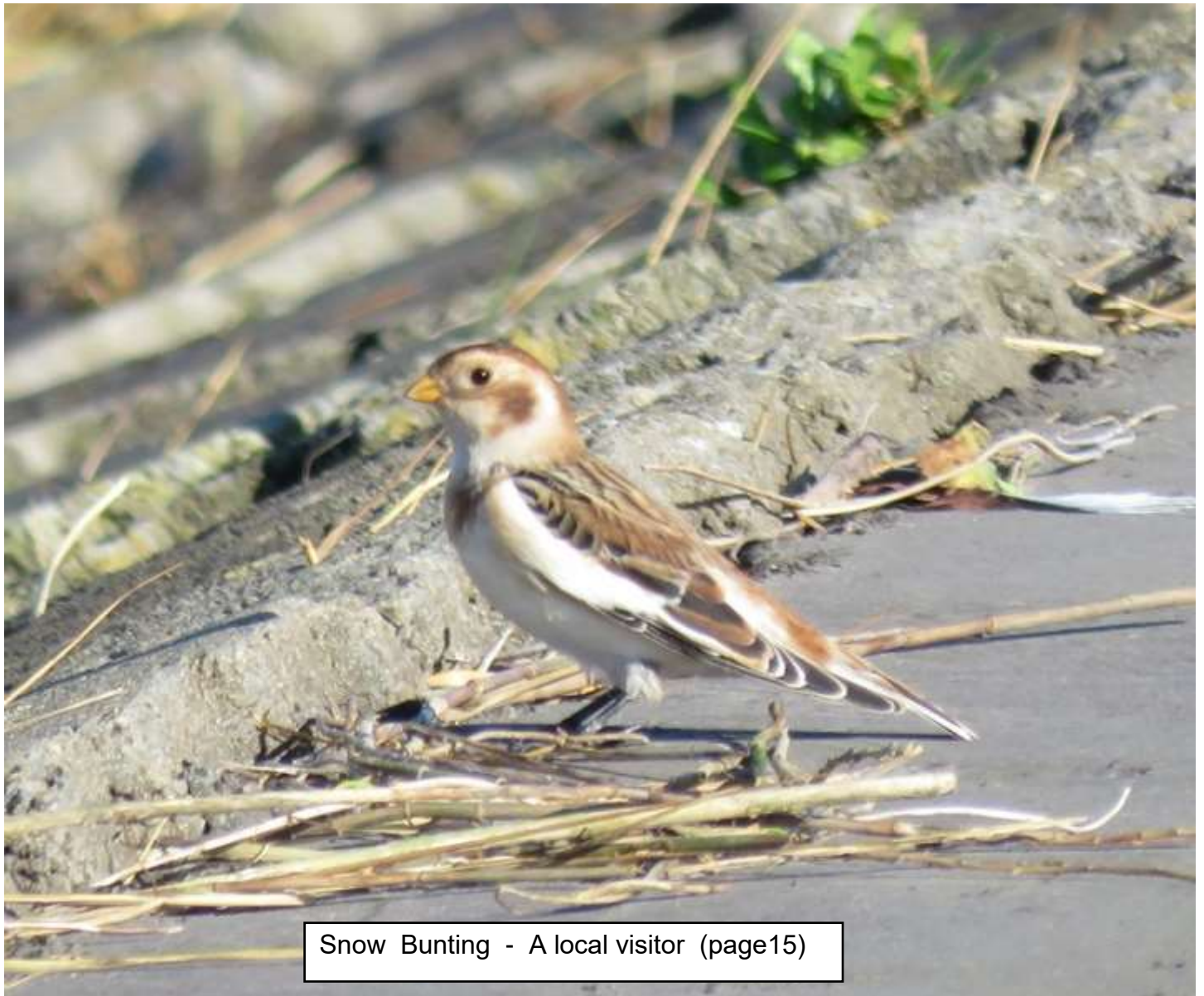
Snow Bunting - A local visitor (page15)