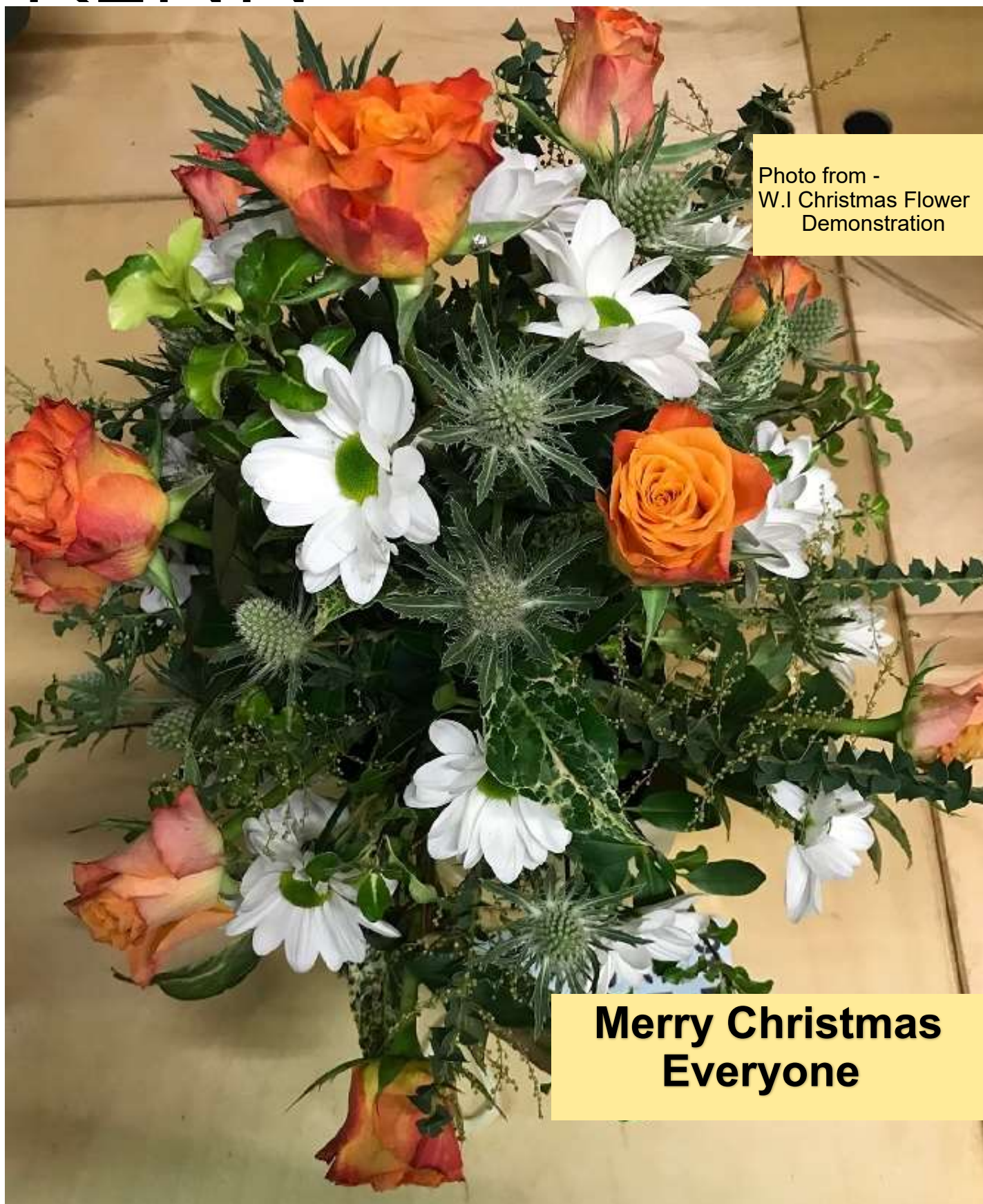
Photo from - W.I Christmas Flower Demonstration