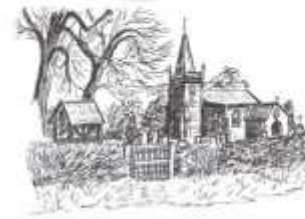
All Saints' Kingston Seymour