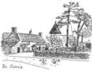
St John's Kenn