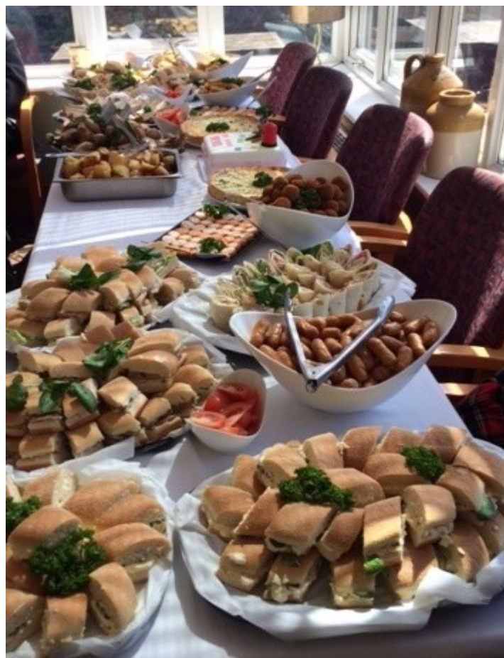
Barbara's 80th Birthday Buffet at the Drum

COD AND CHIPS TAKE AWAY 6pm TILL 9pm ONLY £7.95. COLLECT ONLY