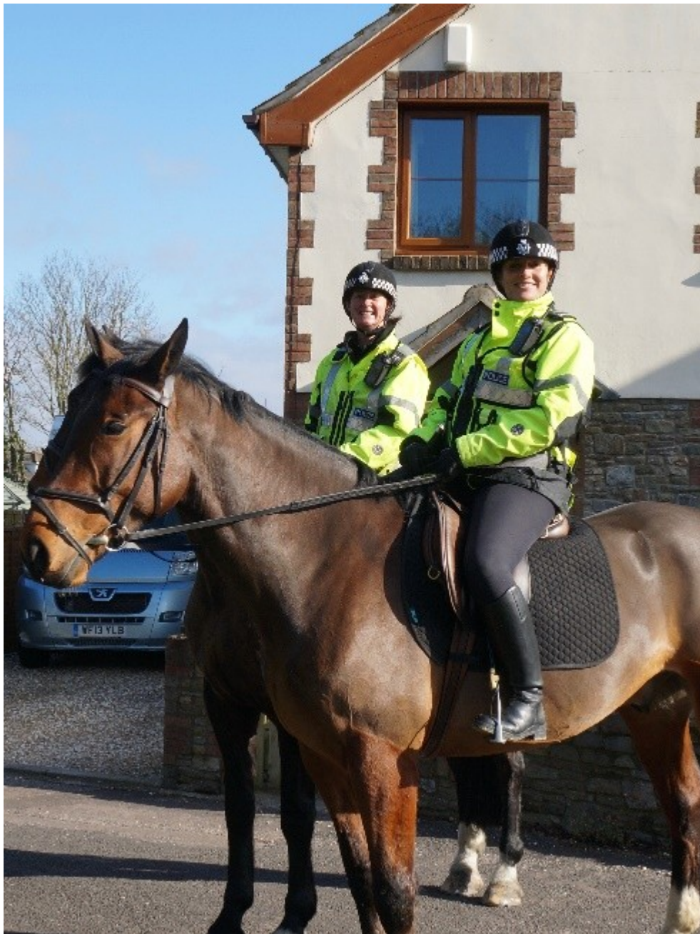
Thanks to Hazel for this picture of young Police Horses being shown the sights of Kenn.